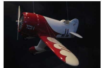
Solid model kits included Curtiss Hawk P6E, Curtiss Goshawk, Boeing P6E, Boeing F4B4, Gee Bee Super Sportster, Curtiss Falcon AC3, and Curtiss Hawk P36. Build times were up to 150 hours.

The property contains a museum, their restored grandmother's home and a reproduction of their original factory. The main factory was a few blocks away from this site and is abandoned. The museum property is funded by a foundation provided by the Stanzel brothers. My only disappointment was that there is a really nice flat field adjacent that is part of the museum property. I really wanted to see how these models flew or better yet fly one myself.... dream on. Our guide did say that some who come to visit bring their own models and sometimes fun flys occur there. Fly Safe, Steve Curran