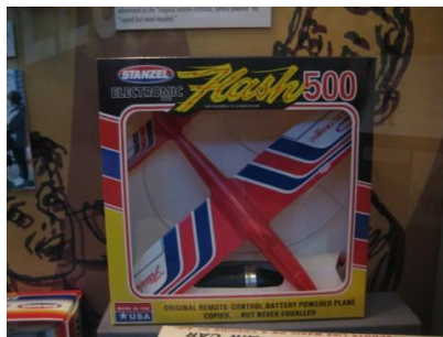
The Flash 500 1958 NFS

It was in 1958 and their ready to fly airplane, the "Electronic Flash 500" is what I