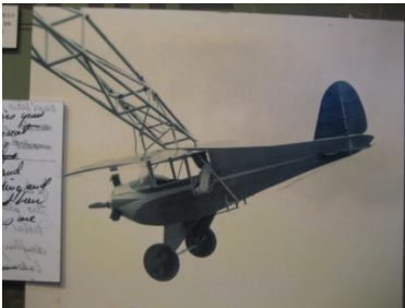
Stanzel U- Control amusement ride

However, it wasn't long before they quit the family farm and began manufacturing kits for a full line of solid models. They also became interested in amusement rides and developed electric powered aircraft that would hold up to four people on a derrick like assembly. Riders could control the flight as the plane revolved about the derrick. The ride was called the Stanzel "Fly a Plane". They also built and patented rocket plane rides .