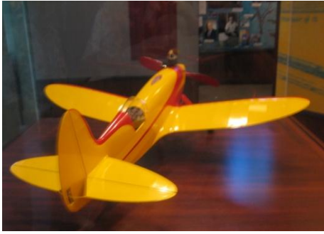
Stanzel "Super V Tiger Shark" this reproduction is a real beauty!

I made a little discovery on recent US 10 road trip to San Antonio....If you recall an article in the previous "Wing Tips" in which our president called for members to visit aviation museums and such....Look what I found in the middle of nowhere! We became aware of this at the Texas Visitor's center where a small poster called our attention to its existence.