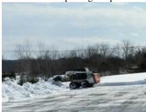
Irvin & Sons runway snow removal