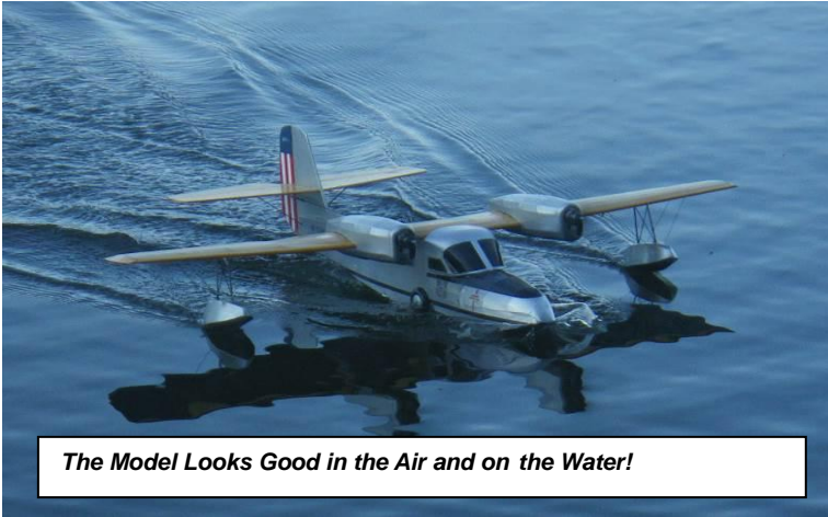
The Model Looks Good in the Air and on the Water!

First flights were in the summer of 2014, and the major problems that showed up had to do with water handling.