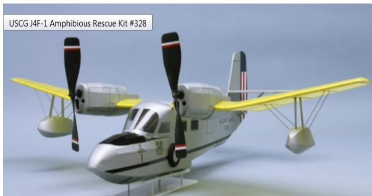
This Photo From the Dumas Website Shows the Model Built – as Intended – For Rubber Power. The Back End of the Rubber Motors (not shown) Hook to the Horizontal Stabilizer.

The covering is Polyspan, with nitrate dope for waterproofing and shrinking. The USCG orange-yellow sections are dye-colored and somewhat transparent, so that the frame can be seen in true stick-and-tissue fashion. The paint is all AeroGloss, which covers well and is very light. The propellers counter-rotate, with the downward moving blade next to the fuselage to minimize water pickup from the bow wave. Ready to fly it weighs 10 oz.