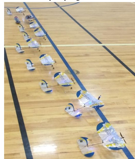
Vapor Pylon Race Starting Line

After initially saying that we should hold off on registering our