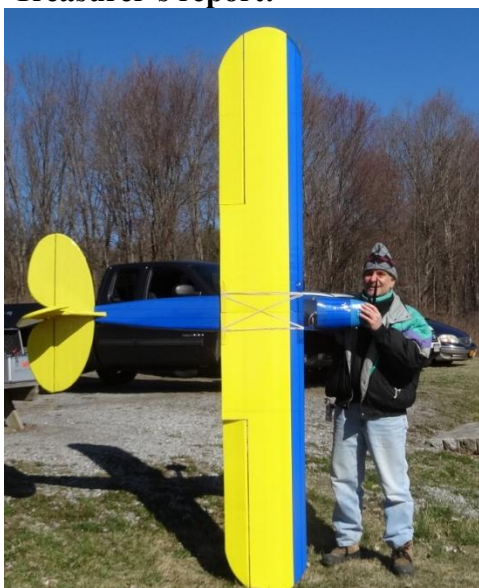
Dom Fusca, Large Cub