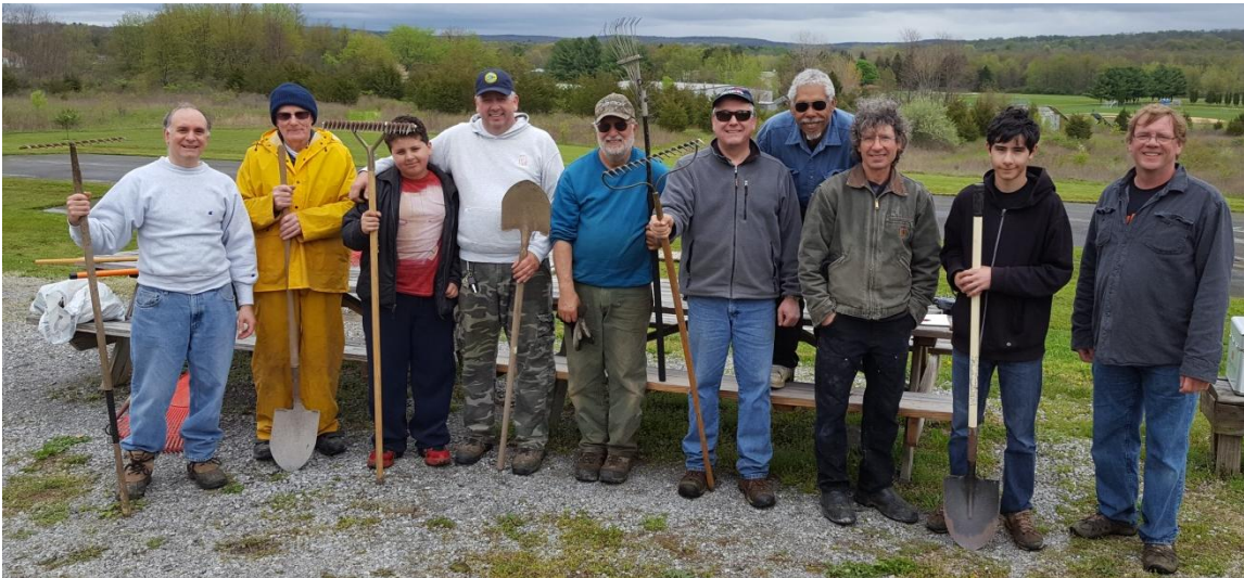
Field Work Day, Sat. May 7

We discussed a schedule of MM dollar amounts for meeting presentations, "mini contest" participation and placement. Some discussion is still ongoing amongst the board members. A table will be posted online shortly.