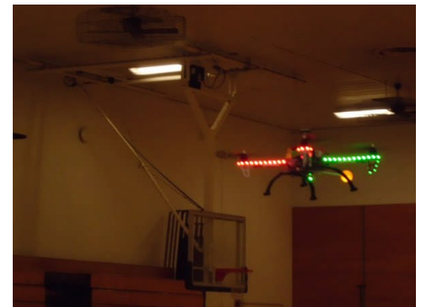
It was equipped with multiple gyros allowing for very stable flight even with hand off