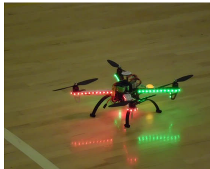
A home built quadcopter from HobbyKing parts