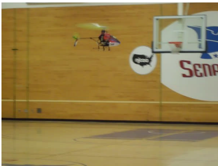
A full functioning mini-helicopter caught hovering