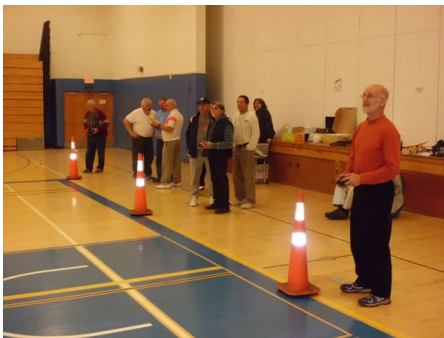
Some of the 18 members that was present at the December UCCC flying session

We would like to see some of the rubber band powered aircraft to come out and join us as well.