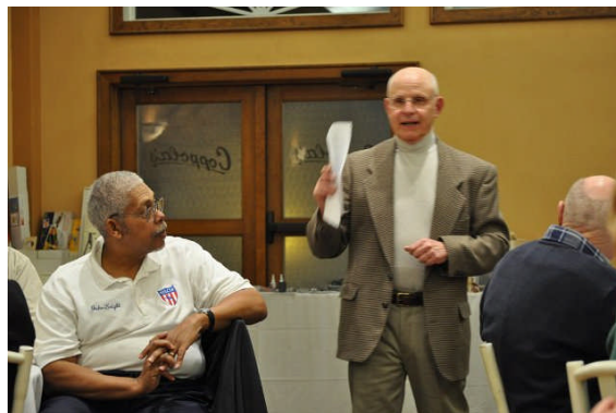
The night began with our President giving us the flight plan for the night.